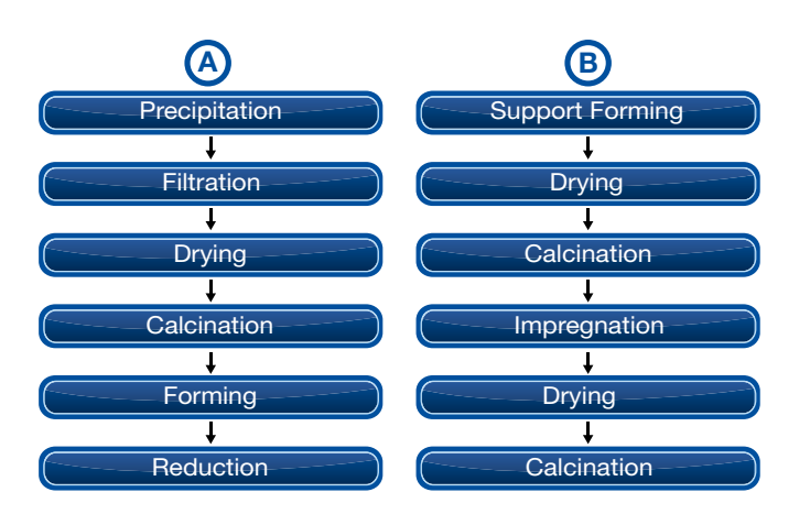
Figure 1: Typical Process Flows

Why do companies around the globe turn to BASF for catalyst development and production? BASF has a wide array of potential processing routes but, more importantly, a deep understanding of how each step of a manufacturing process impacts both product properties and production costs. So, from precipitation through reduction, we can define an optimum process that not only meets our customers' business objectives, but also adds value at each step.