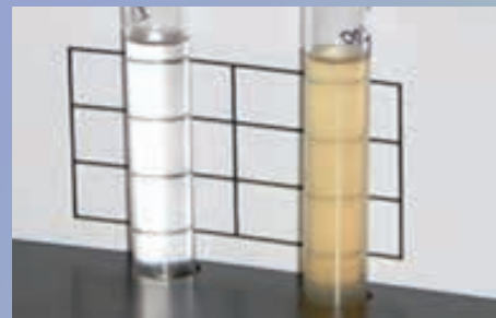
2% Pt Clear and cloudy